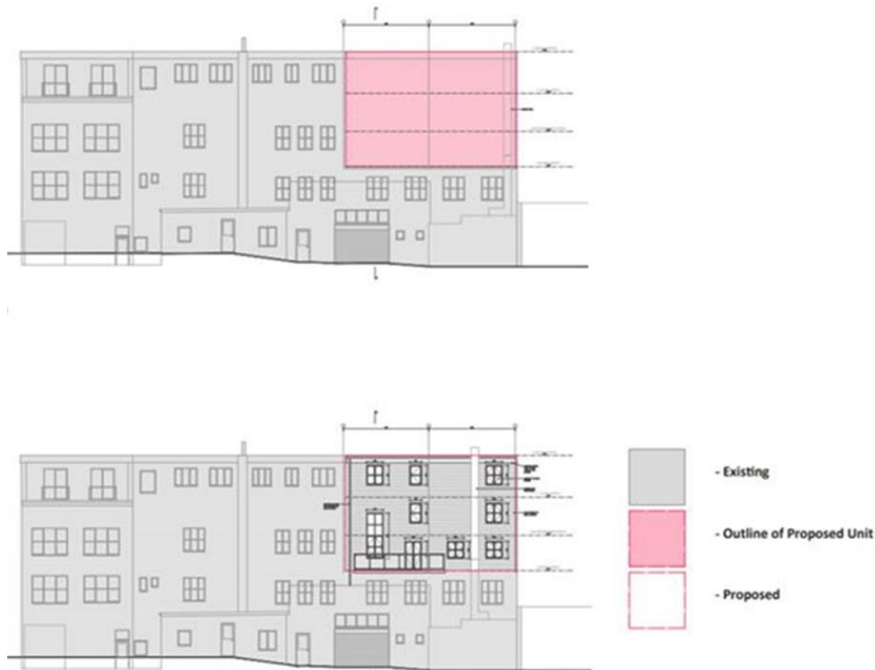
Illustration of the area of the building to be developed with the infill extension: